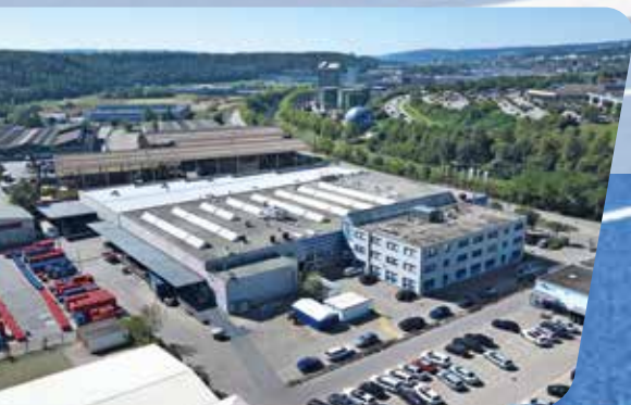
CONICA AG, Schaffhausen, Schweiz